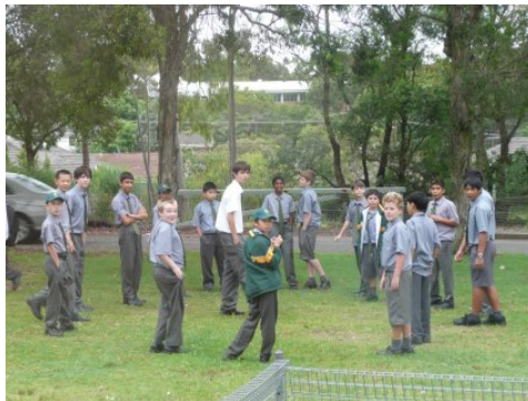
Peer Support Program

Developing in boys the skills to be leaders and good team players is an integral part of many of the programs at Epping Boys' High. Selected students participate in extension programs to further develop their leadership skills. This includes participation in the Leadership In the Middle School Program (LIMS) for junior students and a Leadership Camp for prefects.