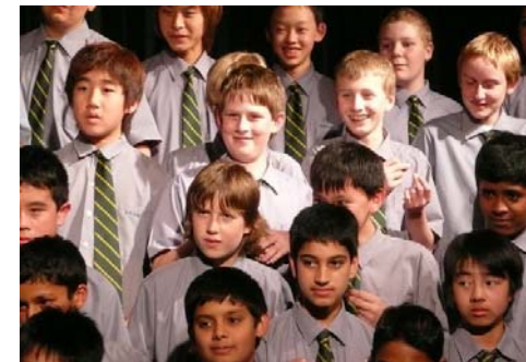
Year 7 Choir