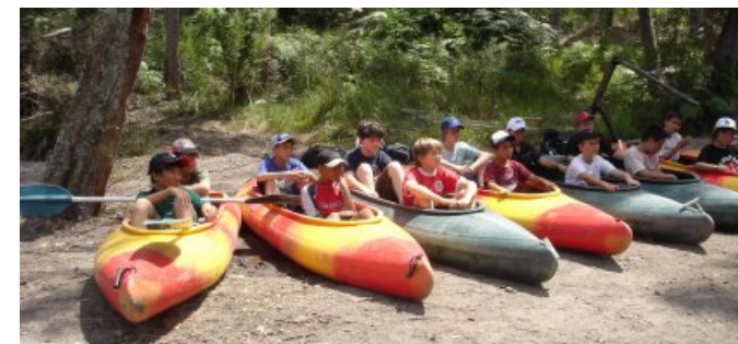
Year 7 Camp